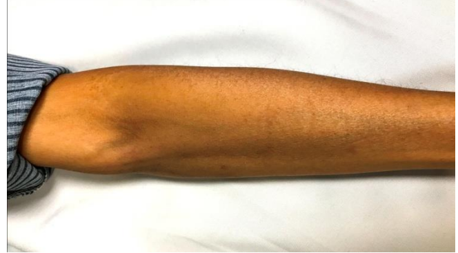
Figure 2: Resolution of hyperpigmentation in leftfrearm veins